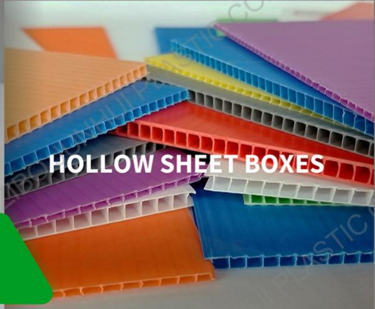
HOLLOW SHEET BOXES