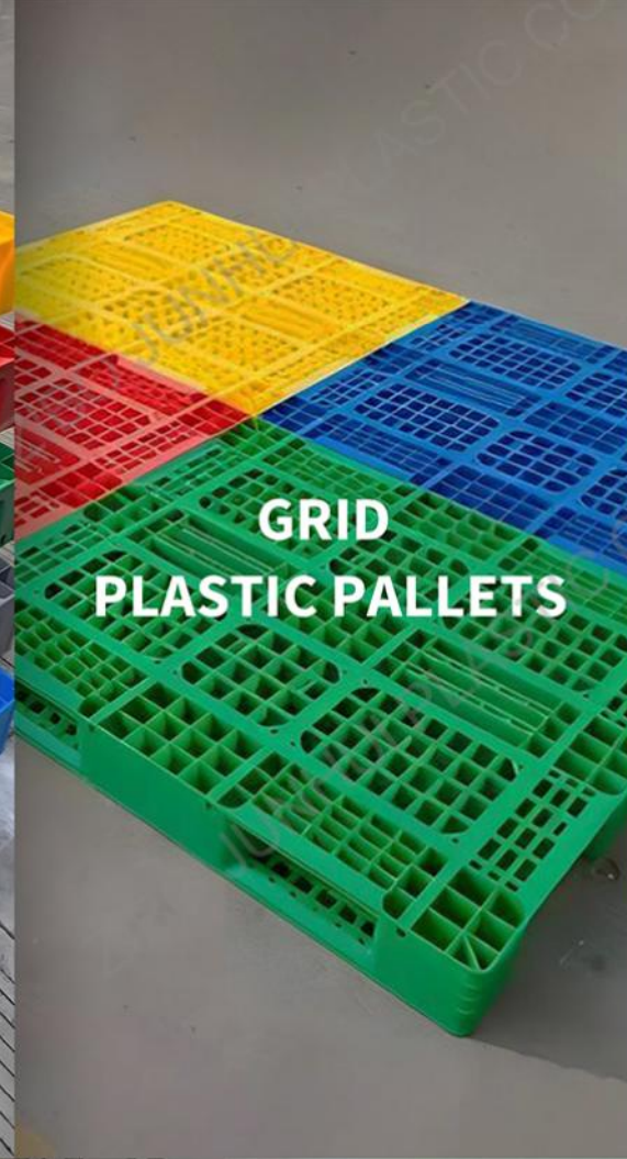
GRID PLASTIC PALLETS