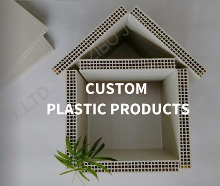
CUSTOM PLASTIC PRODUCTS