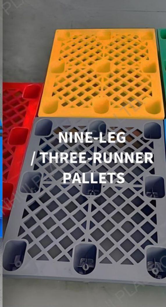
NINE-LEG / THREE-RUNNER PALLETS